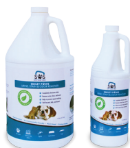
Smiley Paws Urine, Stain, & Odor Remover

StainOut System www.stainoutsystem.com 1611-A S. Melrose Dr. #207 Vista, CA 92081 (760) 224-9352